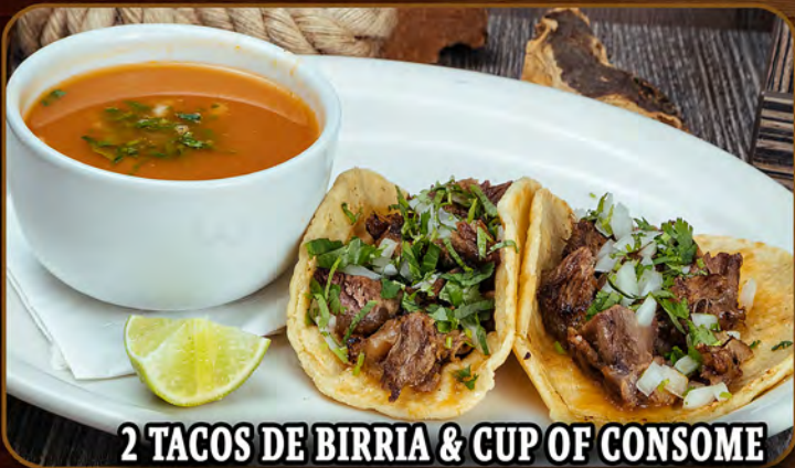
2 TACOS DE BIRRIA & CUP OF CONSOME