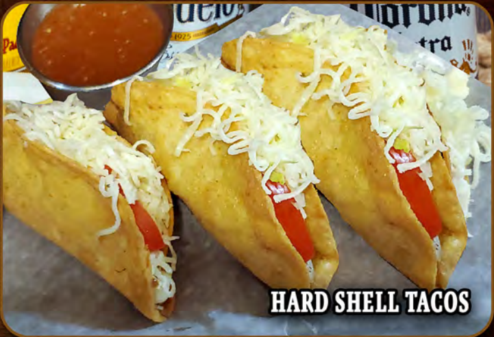
HARD SHELL TACOS

CHICKEN BREAST . . . . . 9.99 Savory seasoned grilled chicken on fresh cut greens with a Maria’s house dressing. DINNER SALAD. . . . . 4.99