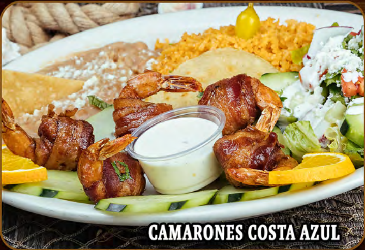
CAMARONES COSTA AZUL