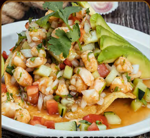
TOSTADA DE CAMARON