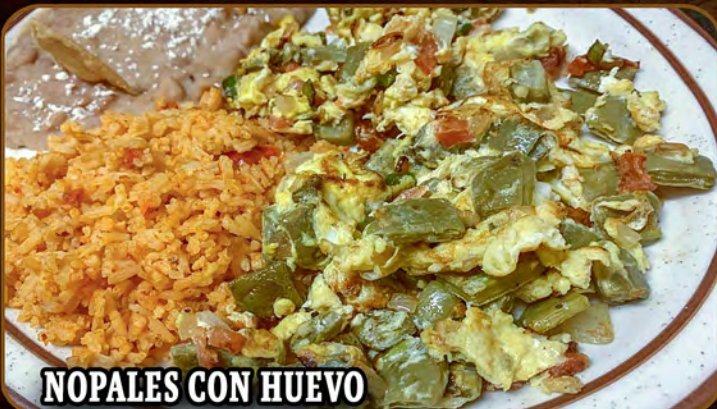
NOPALES CON HUEVO