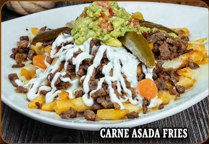
CARNE ASADA FRIES