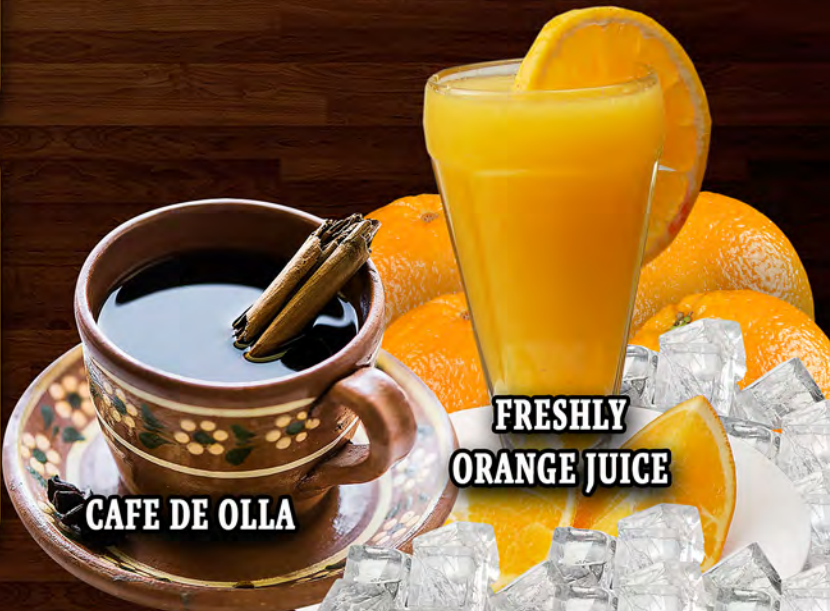
FRESHLY ORANGE JUICE