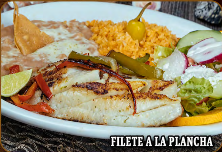
FILETE A LA PLANCHA