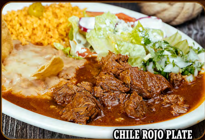
CHILE ROJO PLATE