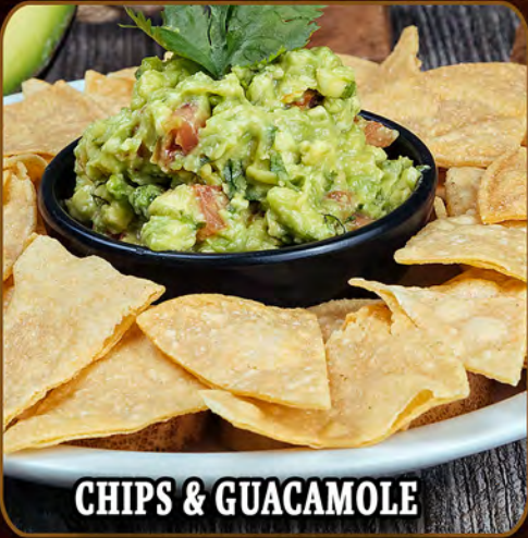
CHIPS & GUACAMOLE