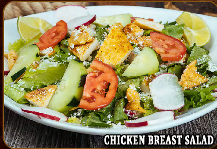
CHICKEN BREAST SALAD

All plates served with rice & beans 1 CHILE RELLENO . . . . .12.99 CHILE VERDE PLATE (Pork) . . . . .12.99 CHILE ROJO PLATE (Beef) . . . . .12.99 3 TAQUITOS . . . . .12.99 3 corn rolled taquitos with lettuce, sour cream, cotija cheese & guacamole. 2 FLAUTAS . . . . .12.99 2 flour rolled tortillas with lettuce, sour cream, cotija cheese & guacamole. 2 SHRIMP TACOS . . . . .12.99 2 FISH TACOS . . . . .12.99