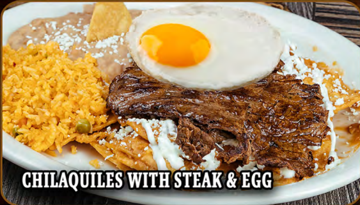
CHILAQUILES WITH STEAK & EGG