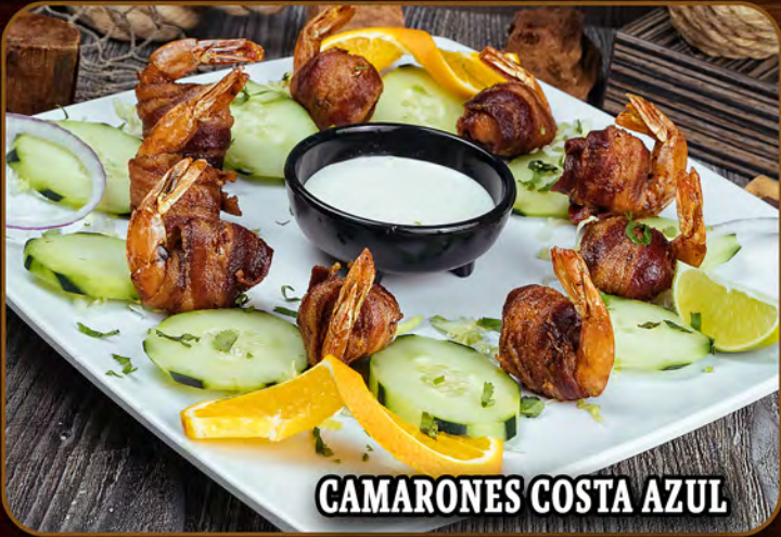
CAMARONES COSTA AZUL