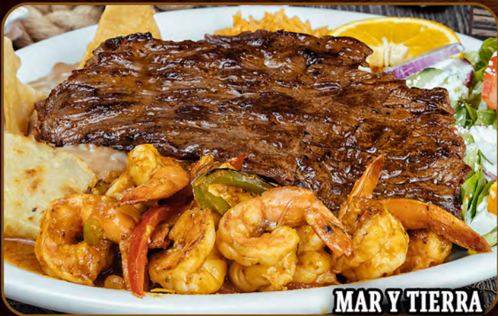
MAR Y TIERRA