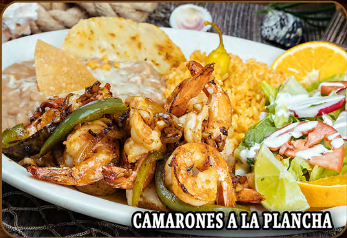
CAMARONES A LA PLANCHA

WARNING: Consuming raw or under cooked meats, poultry, seafood, shellfish or eggs may increase your risk of food borne illness, especially if you have certain medical conditions. This item may be served raw or under cooked at your request.