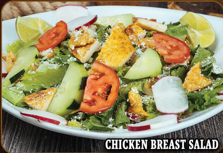
CHICKEN BREAST SALAD