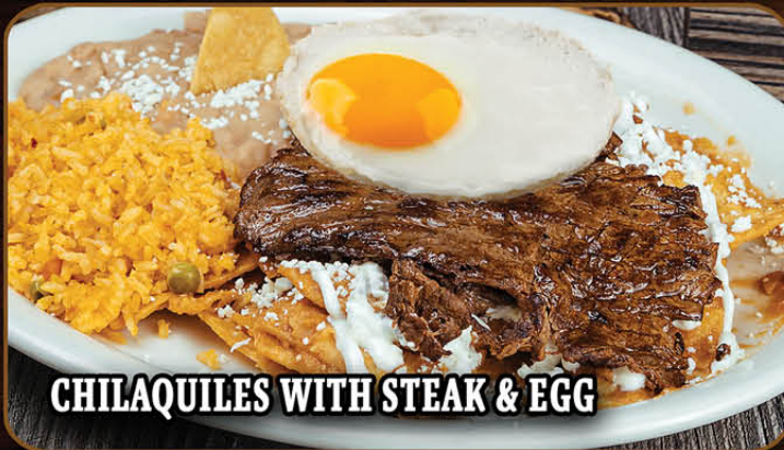
CHILAQUILES WITH STEAK & EGG