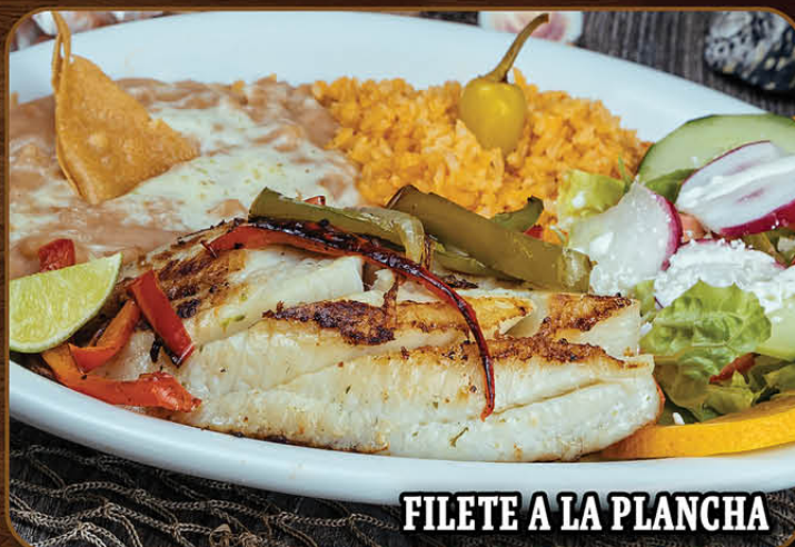
FILETE A LA PLANCHA