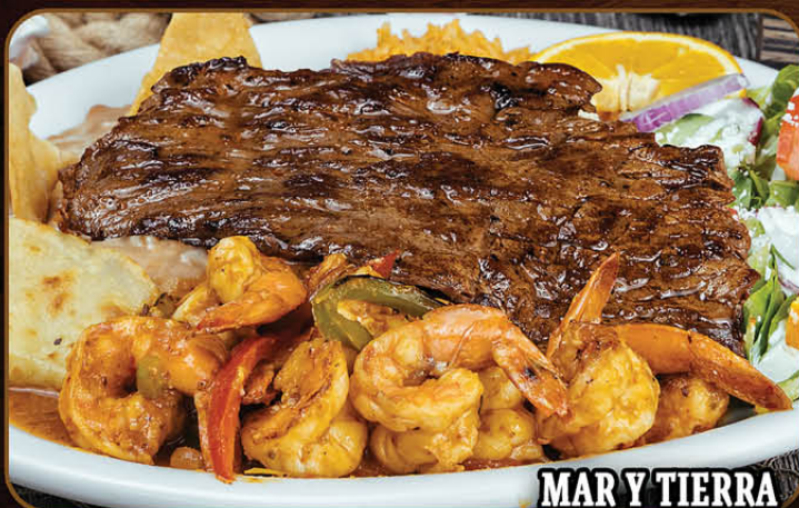
MAR Y TIERRA