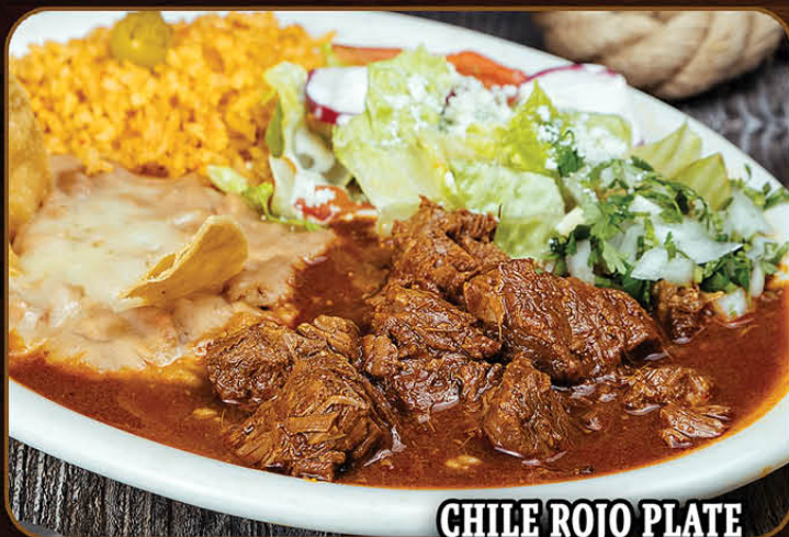
CHILE ROJO PLATE