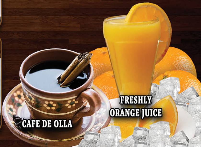
CAFE DE OLLA