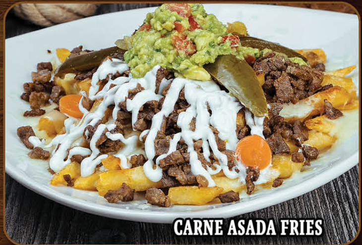
CARNE ASADA FRIES