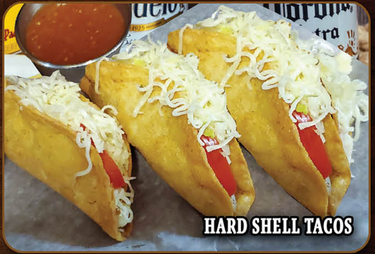
HARD SHELL TACOS