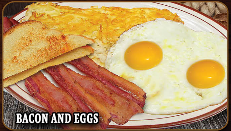
BACON AND EGGS