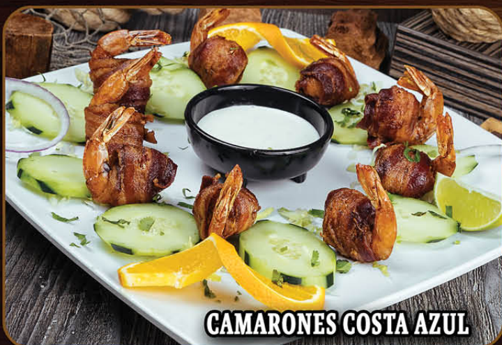
CAMARONES COSTA AZUL