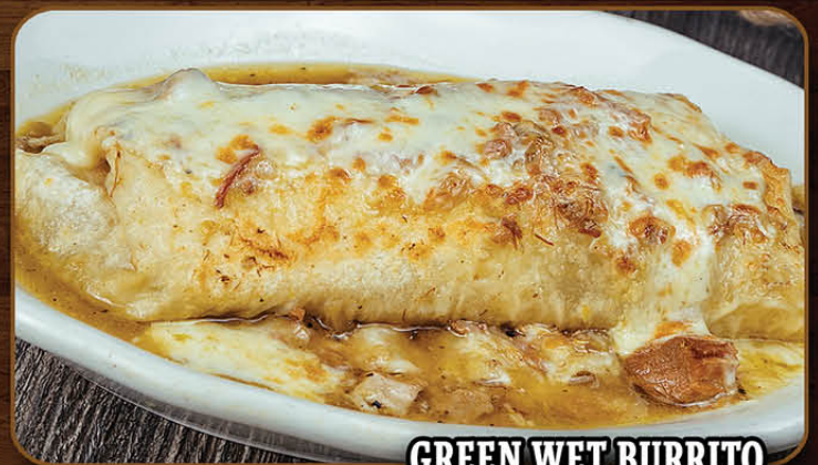
GREEN WET BURRITO