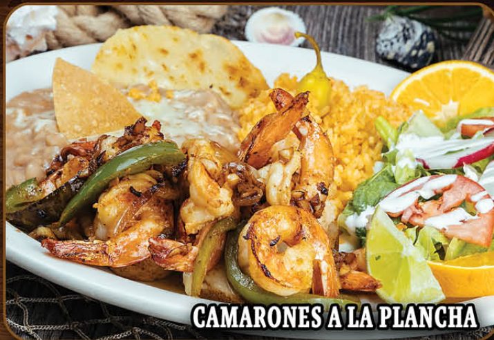
CAMARONES A LA PLANCHA