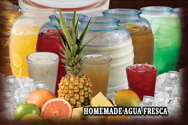
HOMEMADE AGUA FRESCA