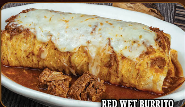
RED WET BURRITO