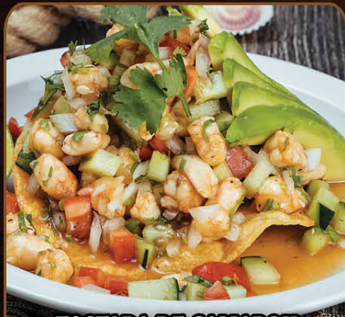
TOSTADA DE CAMARON