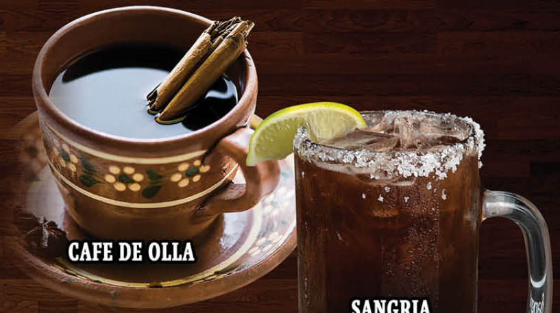
CAFE DE OLLA