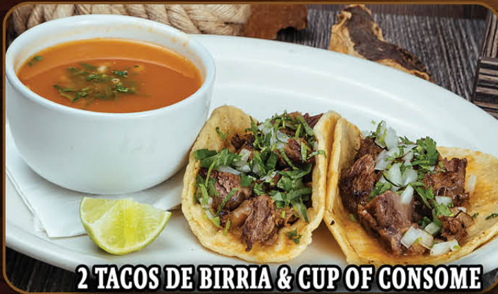
2 TACOS DE BIRRIA & CUP OF CONSOME