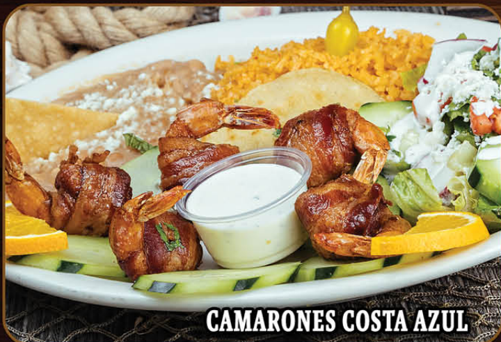
CAMARONES COSTA AZUL

WARNING: Consuming raw or under cooked meats, poultry, seafood, shellfish or eggs may increase your risk of food borne illness, especially if you have certain medical conditions. This item may be served raw or under cooked at your request.