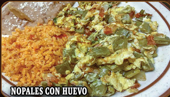
NOPALES CON HUEVO